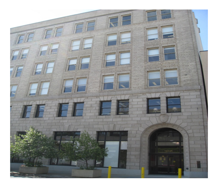
Available parking near our building: *The parking garages are adjacent

Capitol Garage 1500 K Street Sacramento, CA